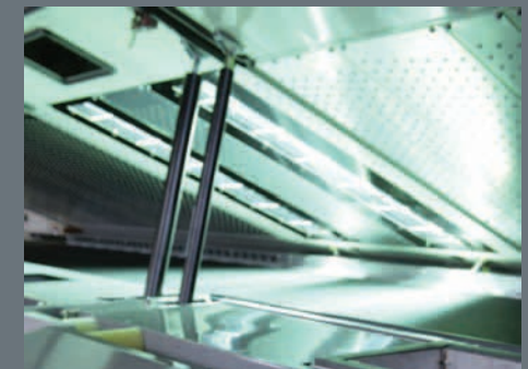
Quartz heat filters